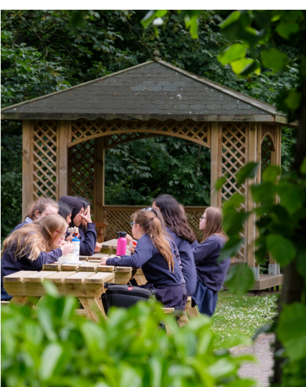
TOP and LEFT . Growing our own produce at our various school allotments. ABOVE . An example of a green space for our pupils to learn and relax in.