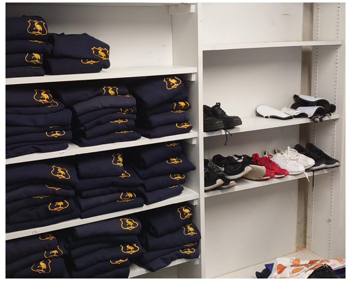
ABOVE. Reducing waste and consumption across the Trust. Here examples of our clothingswap initiatives, at Hookstone Chase Primary School and Skipton Girls' High School for pupils and parents.