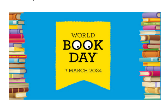
Page 18 // Skipton Girls' High School Newsletter // Issue 103